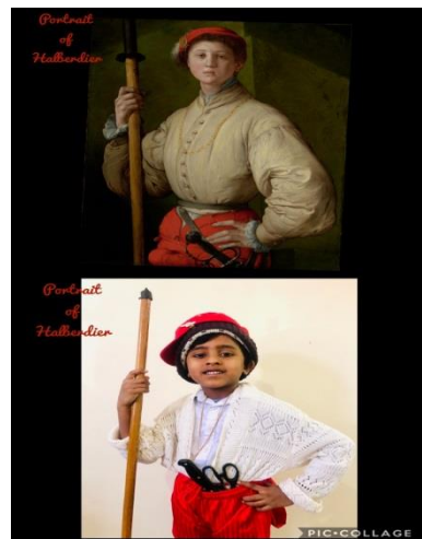
Portrait of a Halberdier by Francesco Guard The Getty Museum