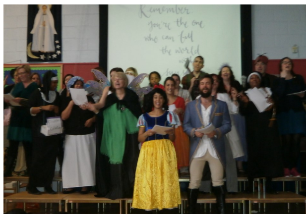
Snow White & the Seven Teachers