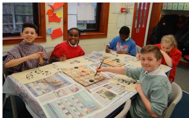
Chinese brush painting