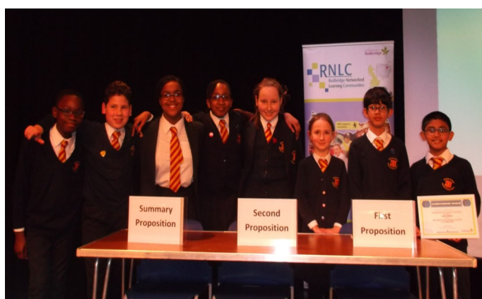
RNLC Debating Competition