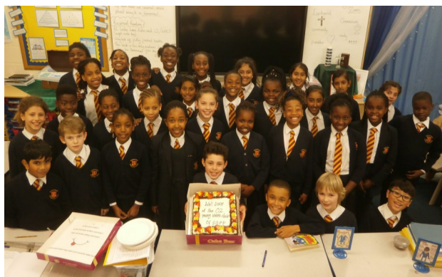
Young Voices Choir